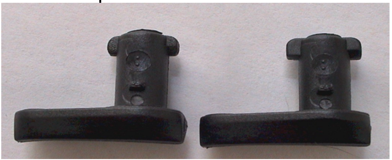
Side view of the old P-Clip