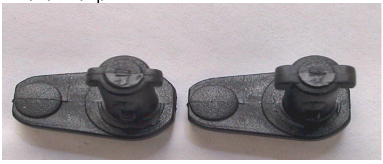
Top view of the old P-Clip